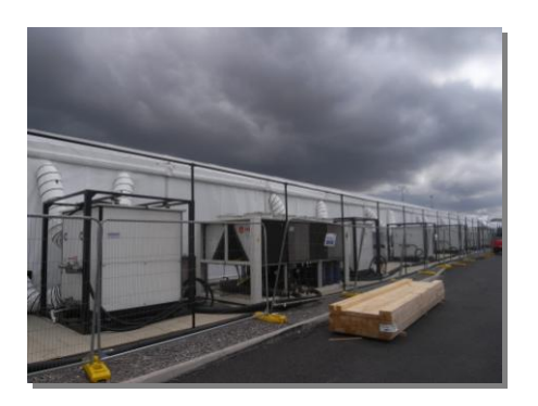
The trane 400kw rental chiller supply the AHU's with cool water