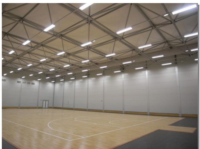
Internal shot of one of the completed basketball courts. One of the 800mm air socks can be seen to the rear

Overall this system offered exceptional service. Temperature control of 2 Degrees around set-point was achieved, well with the 8 degrees specified In the hottest conditions with a 36 Degree outside ambient Temperature the system maintained a internal of 24 Degrees- a 12 degree differential. Early in the project due to considerable rain-fall dehydration was required-high levels of water were removed by reducing chilled water flow temps and using the AHU's heaters to simultaneously reheat space supply air.