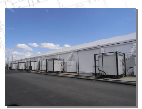
Six ACS 100.60 rental air handlers were fitted.