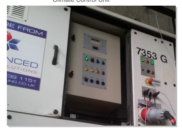
The controls section of an ACS Climate Control Unit

Simplicity of design and versatile equipment was key to fast installation. The ACS 100.60 air handler is a one box heating and cooling solution-quickly installed, they offer full auto control. Electric on- board heating allows simultaneous heating and cooling in different zones as opposed to heat pump systems where all are heating or cooling. Dehumidification is also possible with the reheat option. The chiller is self contained with a pump system fitted. A quick fit modular rubber pipe-work system using Camloc connections is fitted fast and is above all reliable.