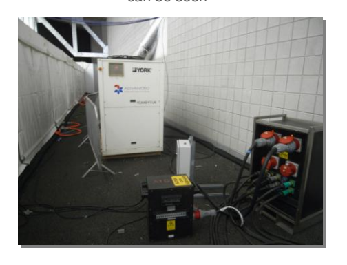
Behind the scenes- the water chiller and distribution system