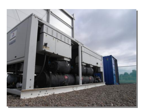
The completed chiller and pump station installation