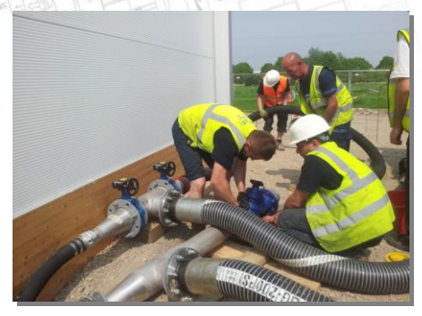
Installing the centralised water distribution system