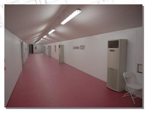
In the athletes tunnel- the 20kw AHU's can be seen